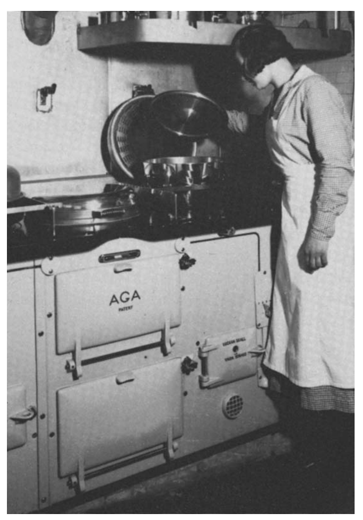
First AGA cooker – patented in Sweden by the inventor Gustav Dalén in 1922.